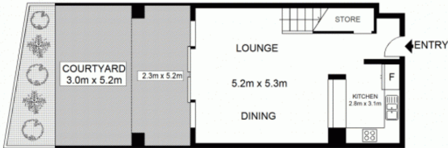
ENTRY LEVEL (LEVEL THREE)